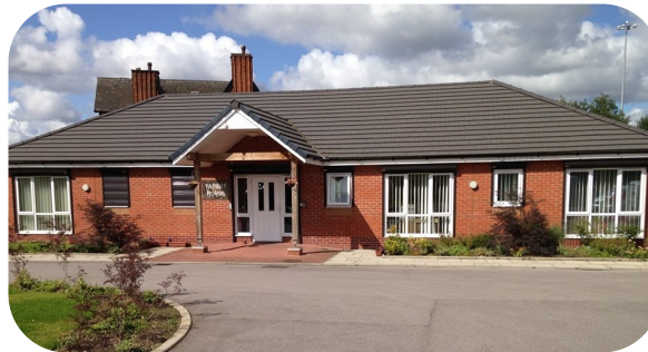
Talbot House Support Centre building

Talbot House, 1 High Peak Street, Newton Heath, Manchester, M40 3AT